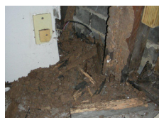
D. Termite damaged structure