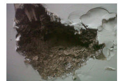
C. Termite damaged wall