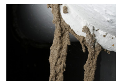
D. 'Mud tunnels' Termite stalacites